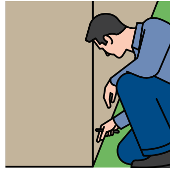
A Certified Sentricon Specialist checks for signs of termites.